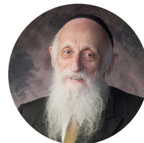
Rabbi Abraham J. Twerski, MD